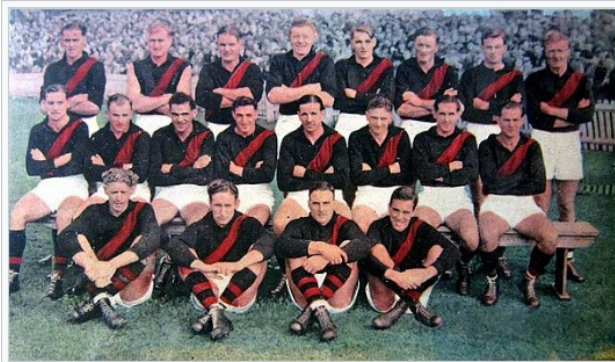
Essendon FC team, premiers