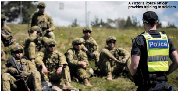
A Victoria Police officer provides training to soldiers.