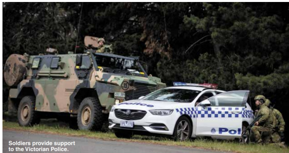
Soldiers provide support to the Victorian Police.